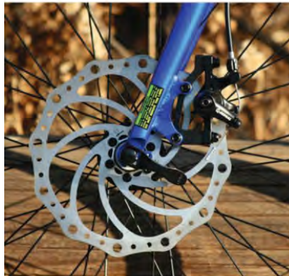
KHS spec'd Bengal MB700T, Mechanical Disc brakes with 203mm Rotors for the aluminum-framed Milano. Total weight is under 40 lbs.

The bike was delivered to our house fully assembled and ready to ride, with only a few minor adjustments to the seat posts, handlebars, etc. My wife and I were ready to ride within 30 minutes (minus the wife, more like 10 minutes). My first impression looking at the bike was that it was a sturdy, solidly built bike with adequate components. When I picked up the bike, I was surprised with how light it was compared to the older Santana Arriva Lori and I were previously riding. All the welds were clean and uniform, and the fit and finish were exceptional for a bike in this price range. I was also pleasantly surprised to see that the Milano came fit with disc brakes, front and rear...What I thought would be a huge plus (more on this later).