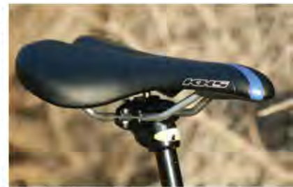
Above left: Barrell adjustors for the shifter cables are a nice touch on the Milano; Tiegra brifters and derailleurs give the captain full control of the team's future. Above right: Nothing much more personal and subjective than bicycle saddles, but our test team found the KHS padded road saddles to provided a nice enough ride. Alloy suspension post for the stoker is a nice – and appreciated – touch.

your fit requires raising and lowering the seat posts and handlebar stems. The model Lori and I tested, the Milano, has a MSRP of $2099.