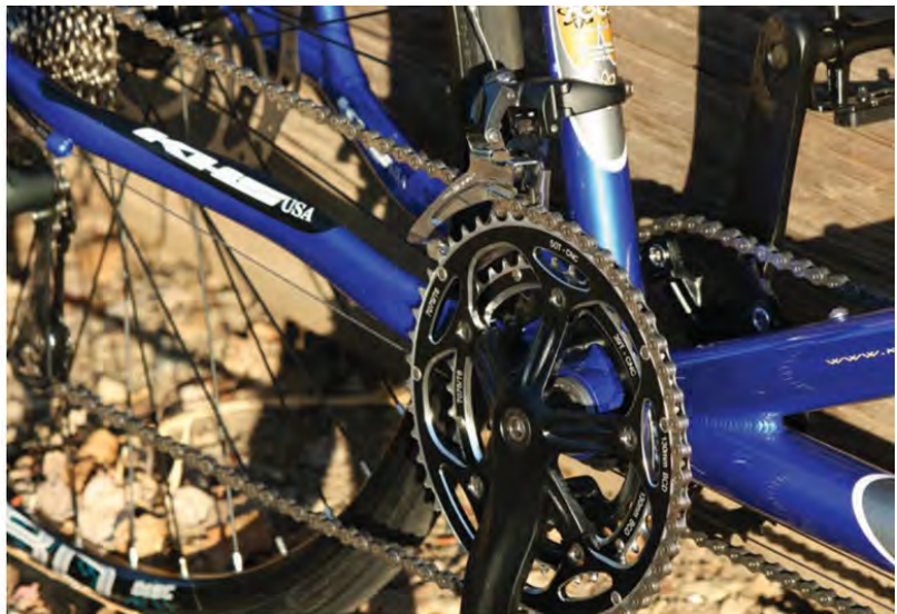
Above: Bright colors and eye-pleasing graphics are part of the package; KHS-branded chainrings have a precision-machined appearance, 50/39/30 ratios. Below: Shimano Tiagra derailleurs front and rear, 11-32 rear cassette provided easy, reliable shifts and range for our test team.